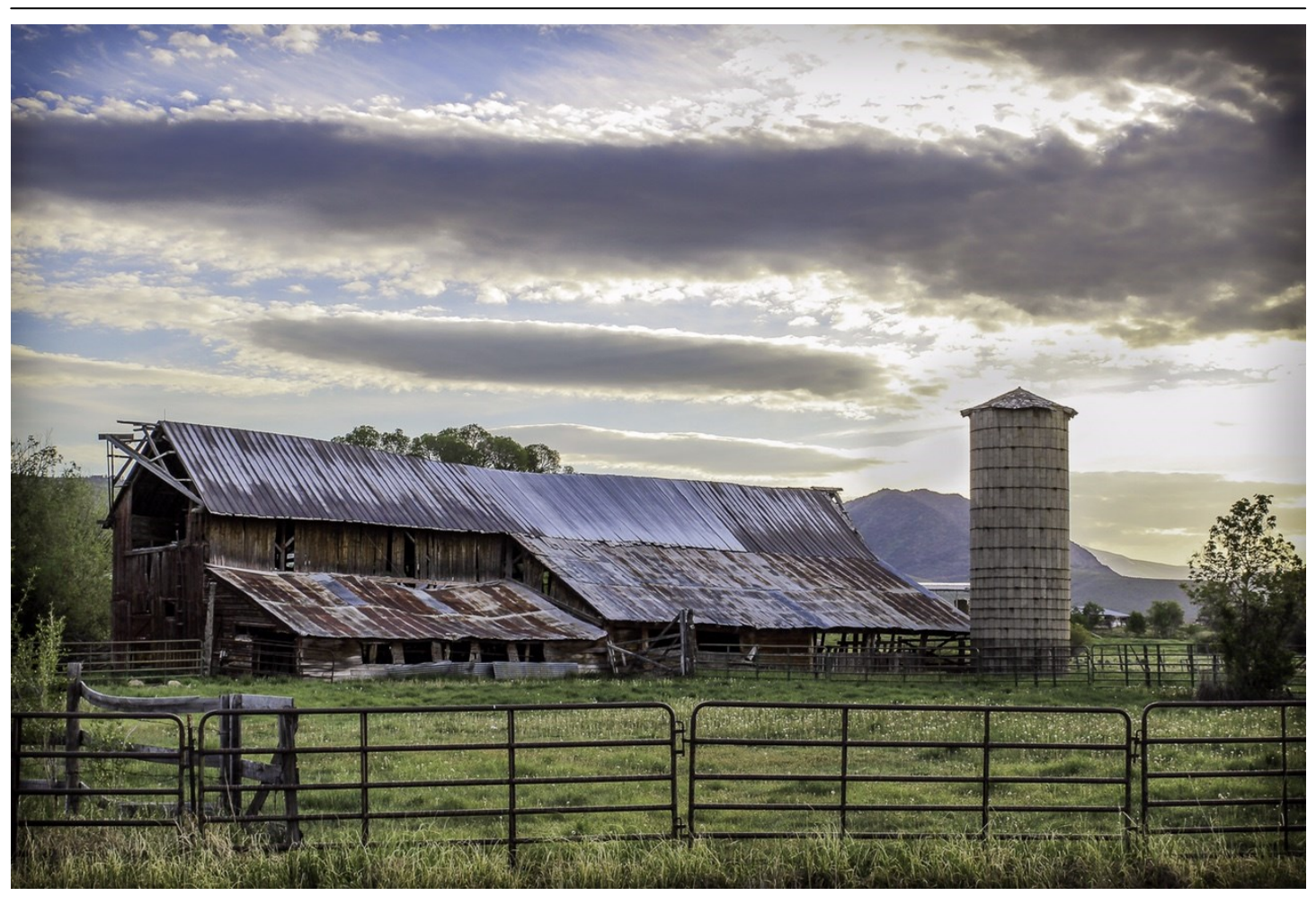
This is a barn in Oakley